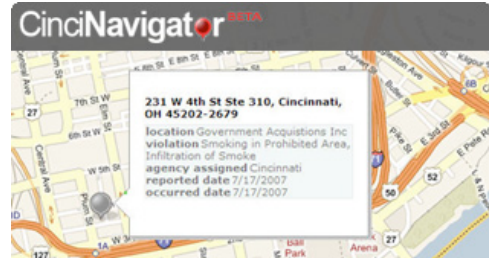
Stay in touch with what's happening in your neighborhood with maps from Cincinnati.com's Data Center